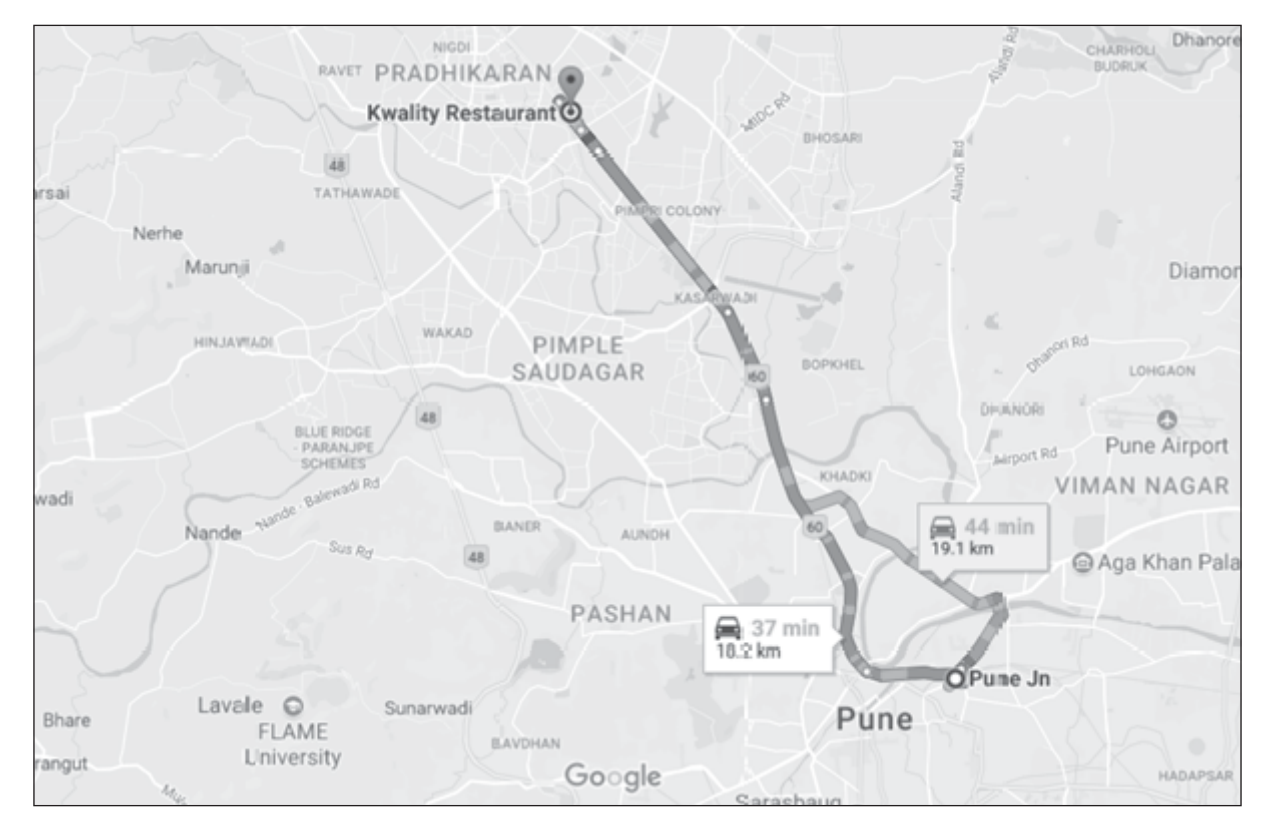
Landmark: Near World of Titan / Fab India Showroom, Chinchwad

Venue : Kwality Restaurant, Mumbai - Pune Road, M.I.D.C., Chinchwad, Pune - 411 019.